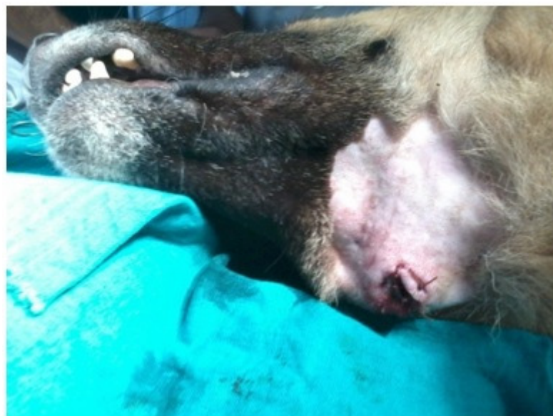
Fig. 3. Photograph showing post surgery