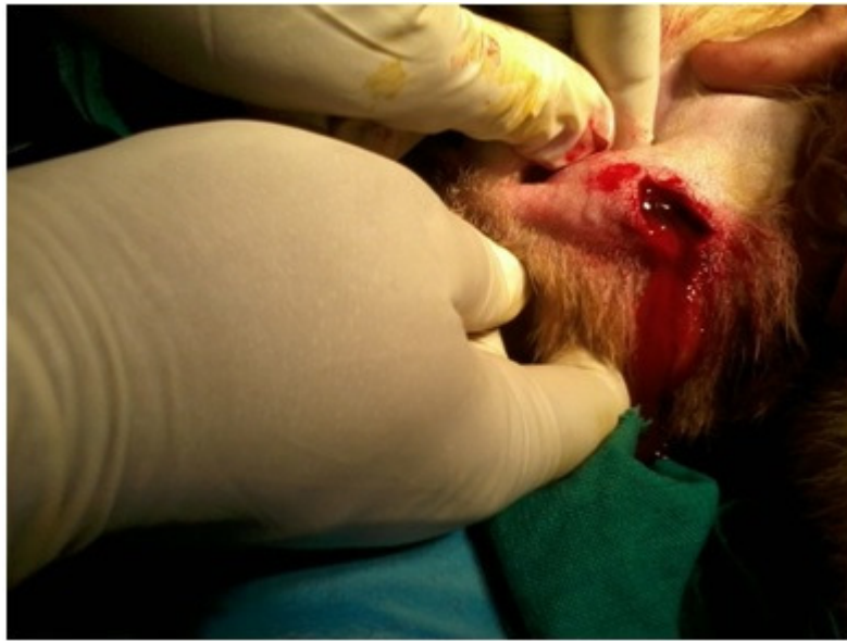
Fig. 2. Photographs showing drainage of the sialocele content (mucoïd and blood tinged fluid)