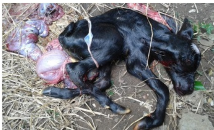
Fig 2: Dorsal deviation of vertebral column and ankylosis of the limbs