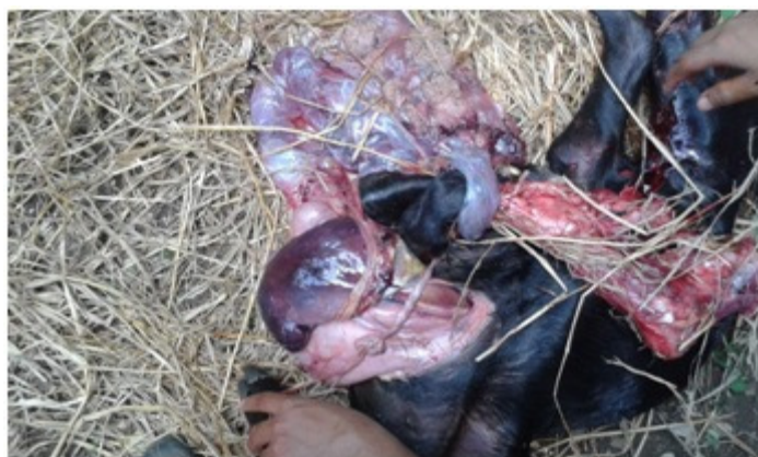
Fig 3: Exposed viscera of the fetus through abdominal fissure.