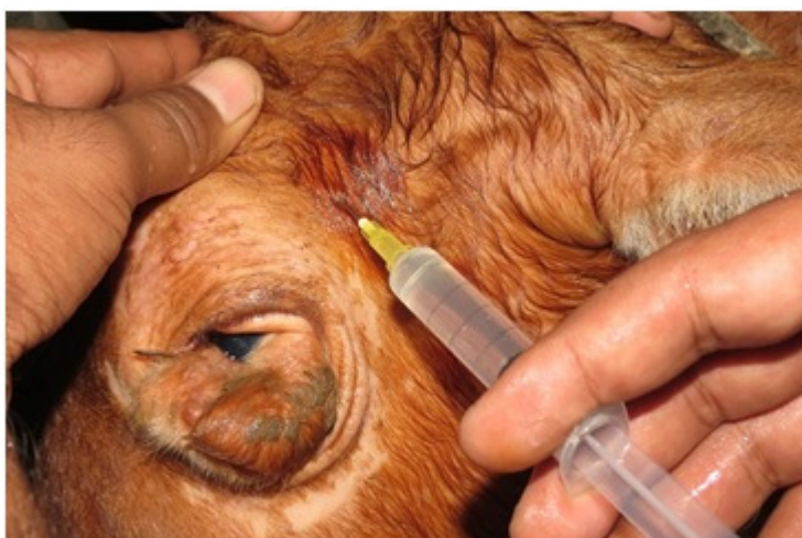
Fig. 4 performing nerve block