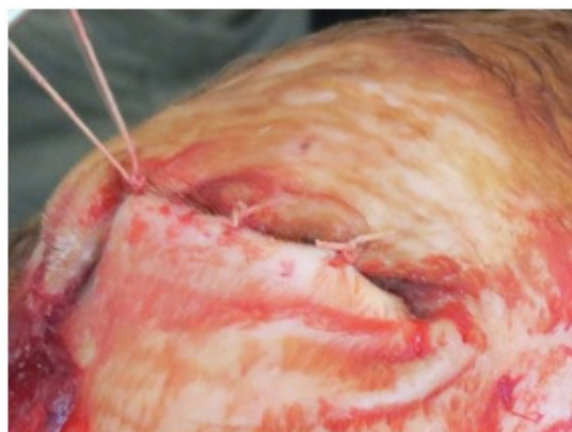
Fig. 7 Performing temporary tarsorrhaphy