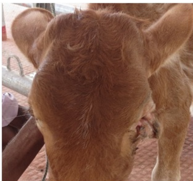
Fig. 1 Overlaying skin of cysts is normal, containing hairs.

A six months old cross bred calf presented with history of having solid skin like mass in both the eyes from birth and gradually increasing in size. Calf having severe lacrimation from past two months and do not gain weight. Clinical examination of both the eyes revealed mild blepharospasm, epiphora, conjunctivitis and having solitary, firm, well circumscribed, smooth, round cysts. Overlaying skin of cysts was normal, containing hairs (fig. 1). Cysts of both the eyes were involved included ventro-laterallimbus, third eyelid, medial canthus, eyelid and bulbar conjunctiva (fig. 2). These were diagnosed as dermoid cysts based on history and clinical examinations.