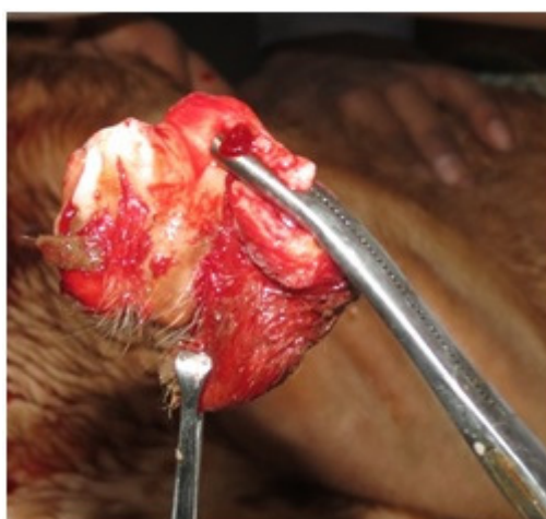
Fig. 5 excised cyst