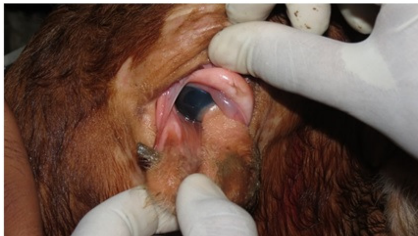
Fig. 2 Cysts involved included ventro-lateral limbus, third eyelid, medial canthus, eyelid and bulbar conjunctiva