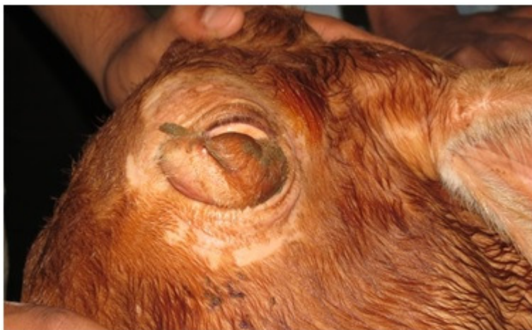
Fig. 3 Prepared eye for aseptic surgery