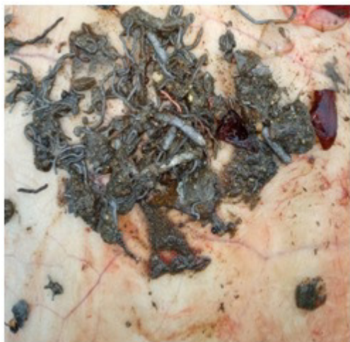
Fig. 3: Recovered foreign bodies from abomasum (sand particles, pieces of aluminum wire, broken bangles and broken glasses)