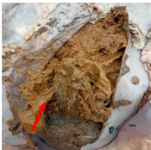
Fig. 4: Presence of foreign bodies in rumen