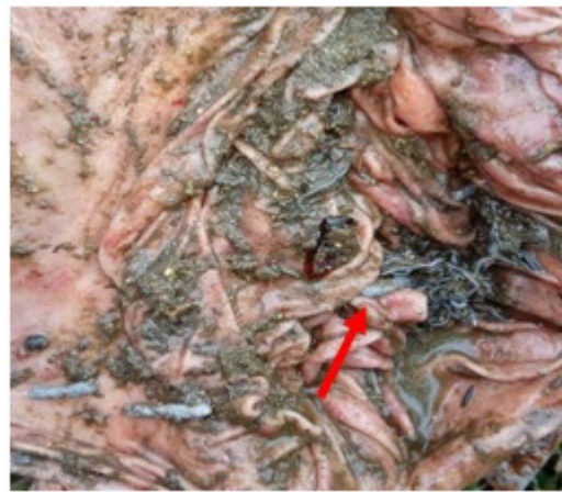
Fig. 2: Presence of foreign bodies in the lumen of abomasum