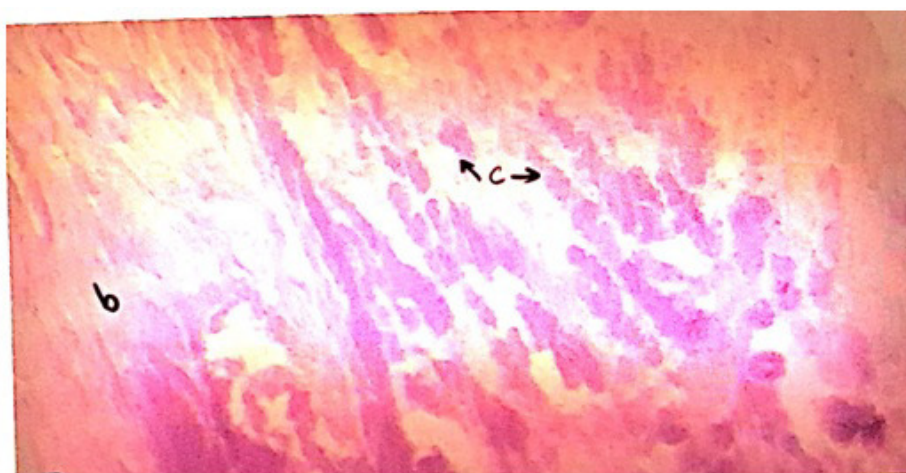
Plate No. 2 Microphotograph of Uterus during estrous phase showing [PAS 10X] a. Perimetrium b. Myometrium C. Endometrial Glands