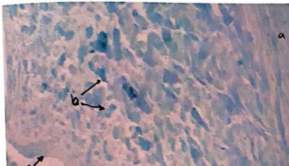
Plate No. 3 Microphotograph of Uterus during proestrous phase showing [Morwreys Collidal iron 10X]