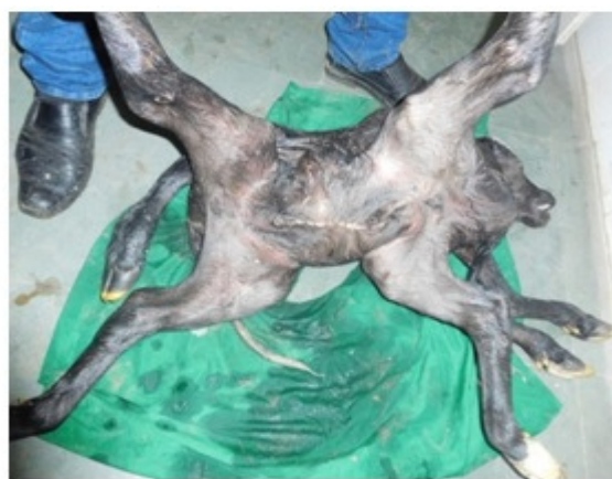
Figure 2: Conjoined male twin fused at the thoracic region