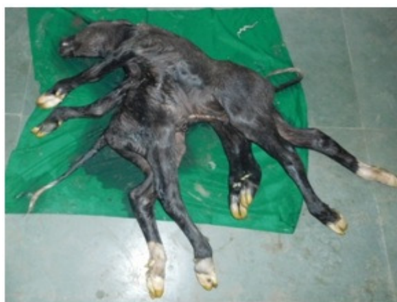
Figure 1: Full developed conjoined twin with eight limbs

There were comparably fully developed pelvic bones which were attached with the spine almost at the area from where the forelimbs originated. However, the correctness of the configuration of the pelvic girdle in the smaller foetus could not be ascertained due to the lack of a sufficient number of radiographic images.