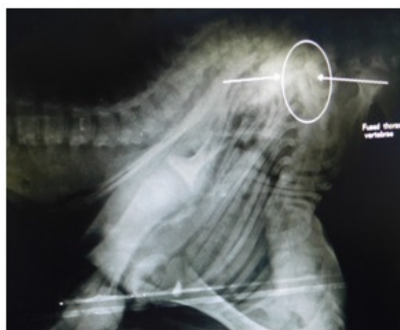
Figure – 4 Attached spine with the thorax of large foetus