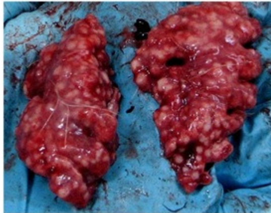
Fig.1 Grayish white nodules in the lung parenchyma.

Clinical signs reported in the affected birds in these 9 farms were dullness, unthriftiness, ataxia, emaciation, respiratory distress and open mouth breathing. Upon gross examination of the carcasses at necropsy, all the carcasses revealed grayish white firm nodules of 0.1 to 0.4 cm diameter in the lungs (Fig. 1) and thoracic air sacs. In three cases, these nodules were found on the heart, air sacs, liver and kidneys.