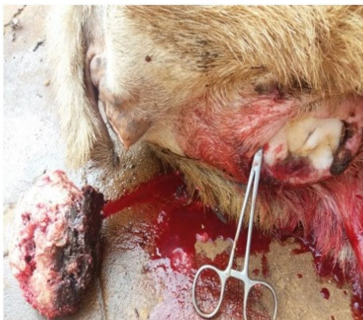
Figure 2: Gangrenous tissue showing black discoloration and sharply demarcated from unaffected area