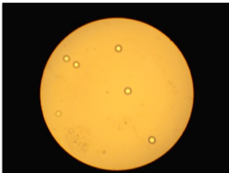
Figure 1: Optical photomicrograph of the enrofloxacin loaded PHBV microspheres (100X)